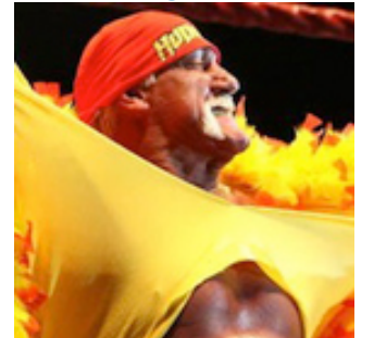
10 Activities To Do With Your Shirt Off That Impress Chicks

5 Things Nice Guys Do That Make Them Look Like D-Bags