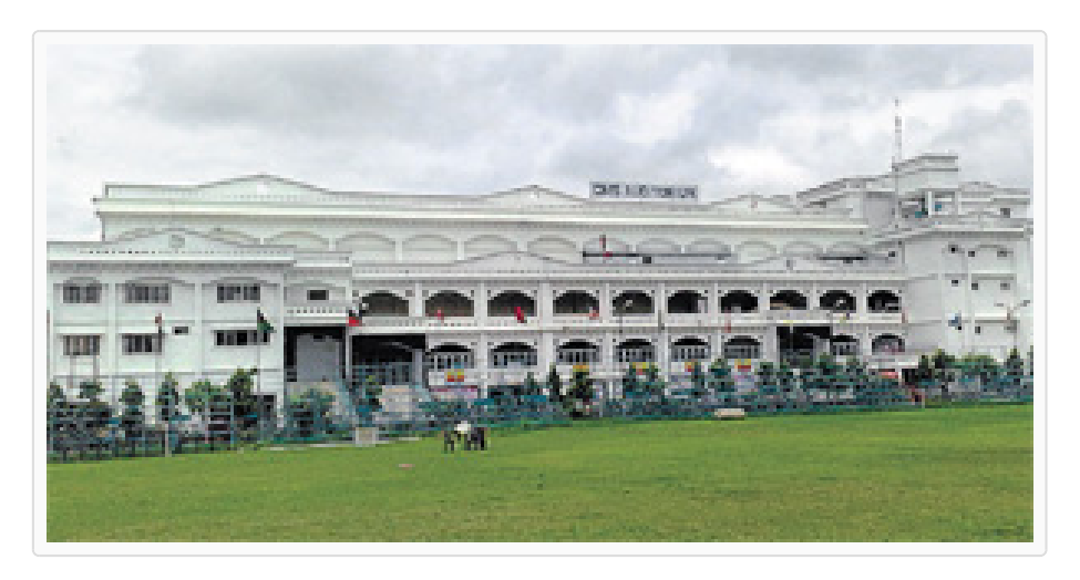
The City Montessori – World's largest school picture

The record book said that the school had 39,437 students on August 9, 2010 enrolled at its different branches in the city, which made it the largest in the world.