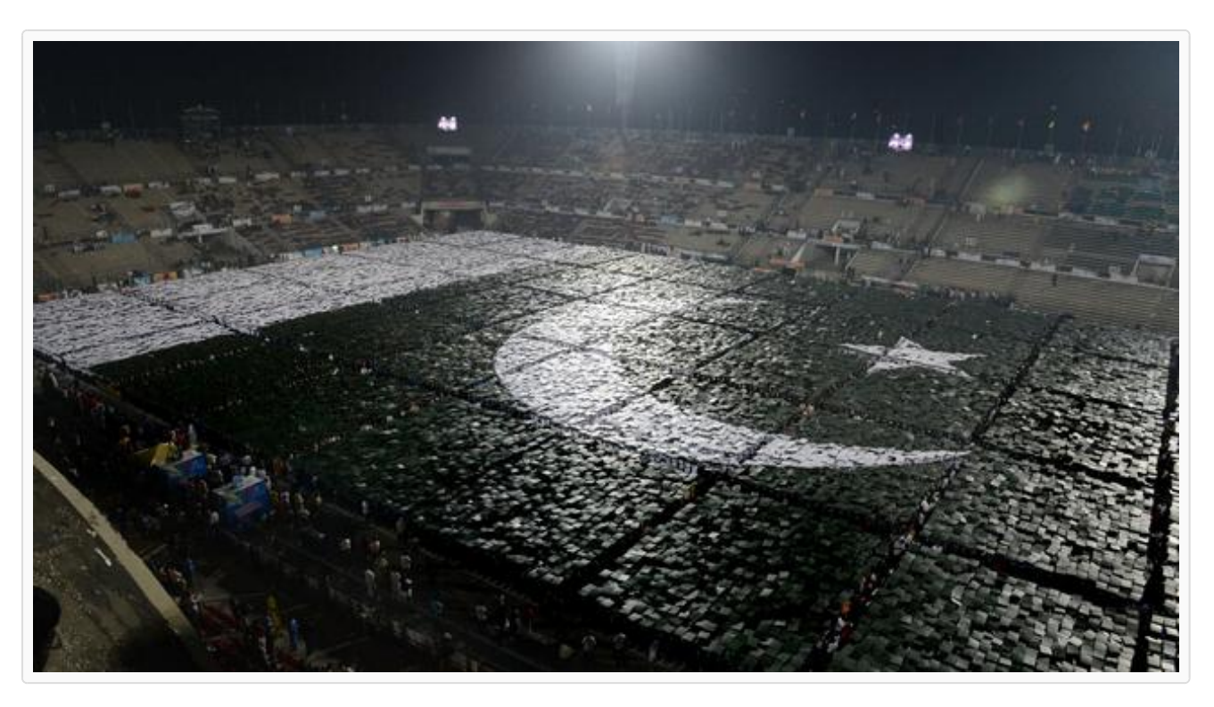
World's largest human flag picture

A total of 24,200 people stood up in the national hockey stadium to make the green and white Pakistani standard, smashing the 2007 record set by 21,726 people in Hong Kong.