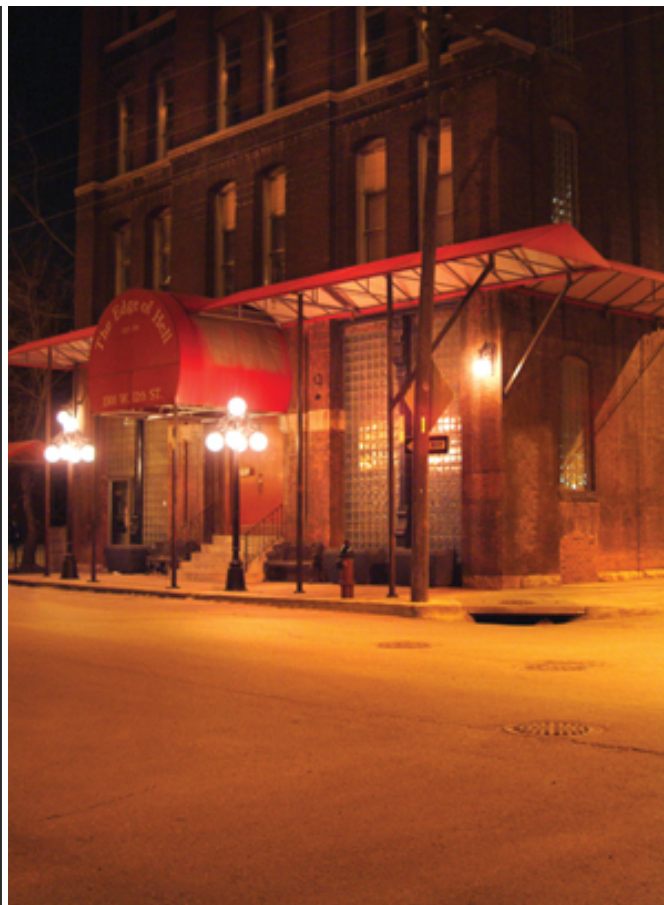
The Edge of Hell