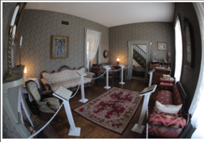
Independence Square Friday Night Ghost Tour