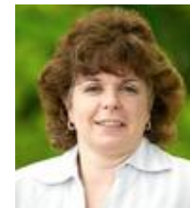
Emelia Waters Americlean Industrial and Commercial