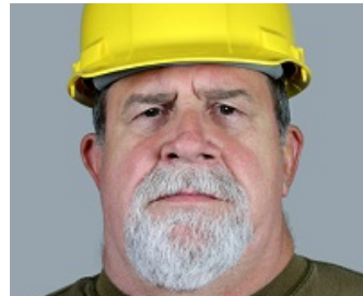
The 5 Warning Signs of Prostate Cancer New smax Health