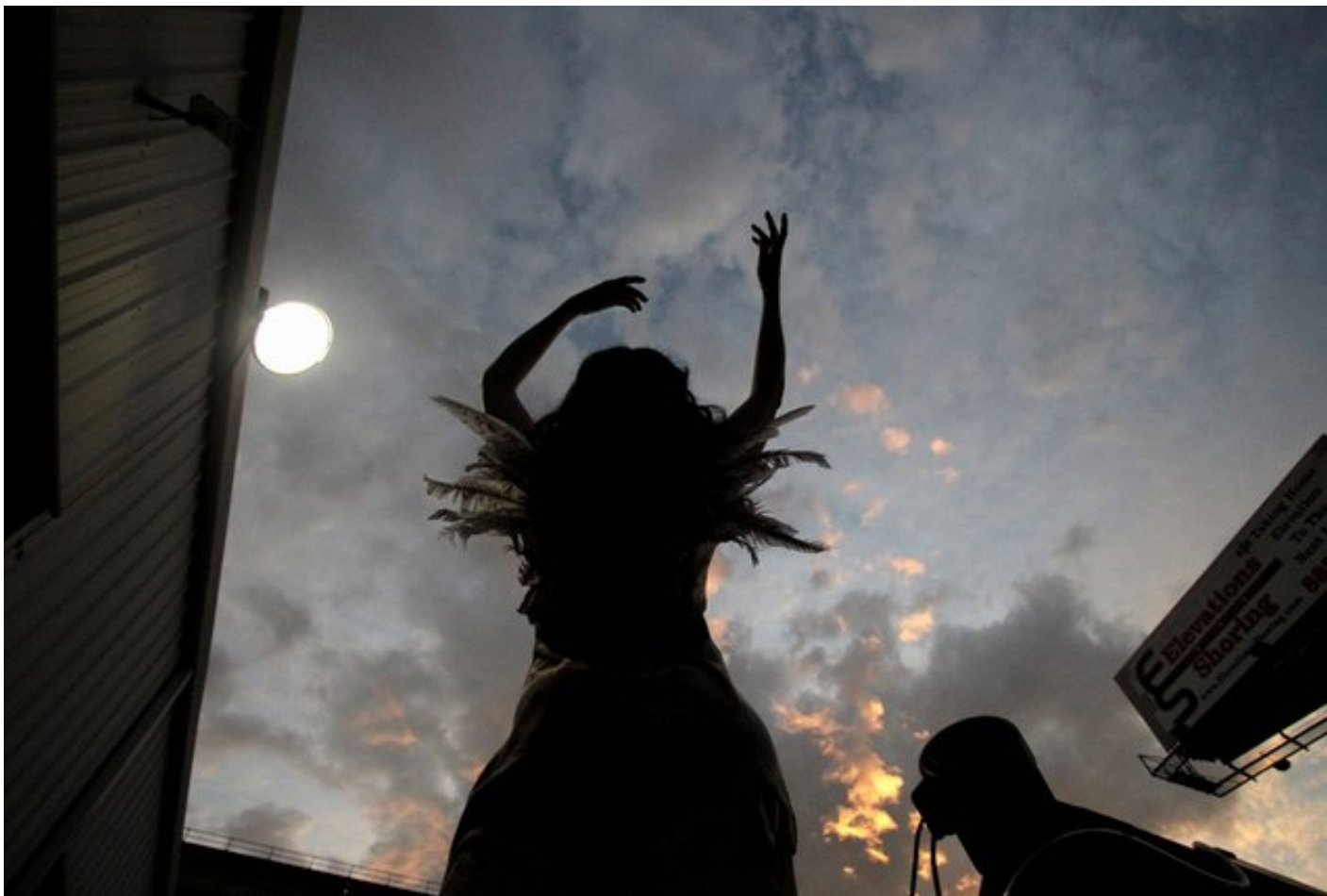
Role-playing actors in costume and makeup pose in their settings at the House of Shock, a haunted house in New Orleans. The attraction was started by three childhood buddies and draws 25,000 visitors annually.