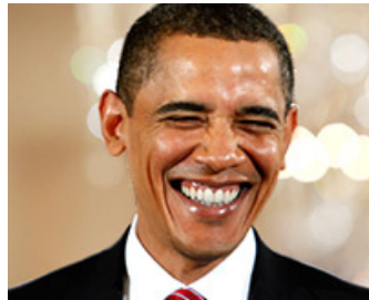
Billionaires Dump Stocks, Prepare for Collapse (Shocking) New smax